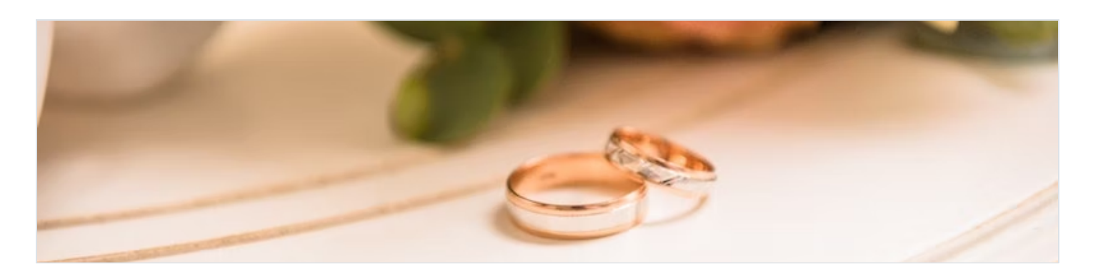
9 Things To Do With Your Wedding Ring After a Spouse's Death