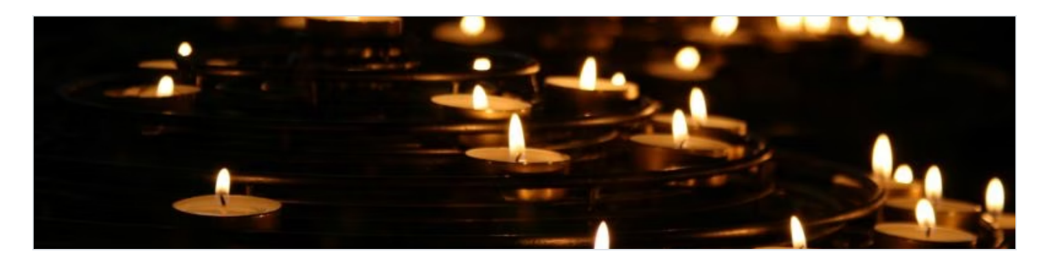
12 Best Online Memorial Sites: Cost, Features + Reviews